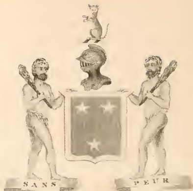
Sutherland of Thre